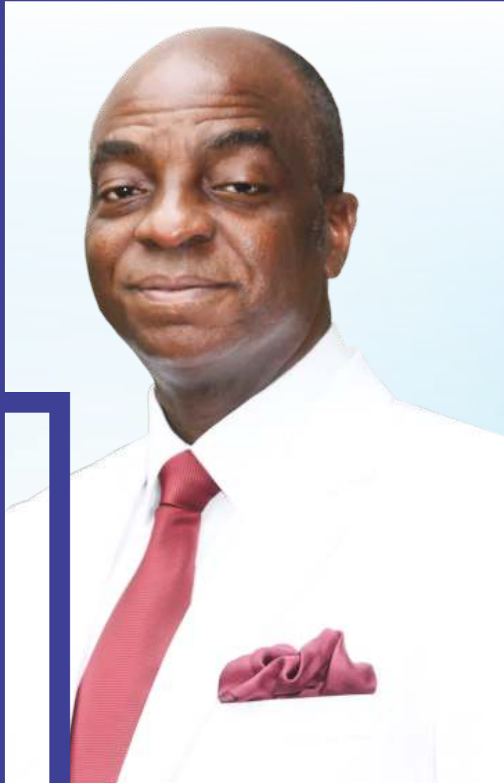
Dr. David O. Oyedepo Chancellor, Covenant University