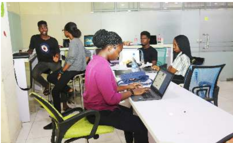
Student Innovators at the Hebron Startup Lab

The Covenant University's Hebron Startup Lab (HSL) has received a £10,000 scale up grant from the British Council. The grant will be jointly utilized with Kwara State University's Entrepreneurship Centre (EC) for the purpose of launching and developing Startup and Spin-off companies to solve problems, create wealth and