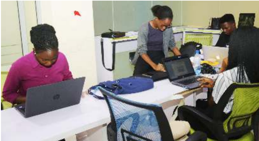
Student Innovators at the Hebron Startup Lab